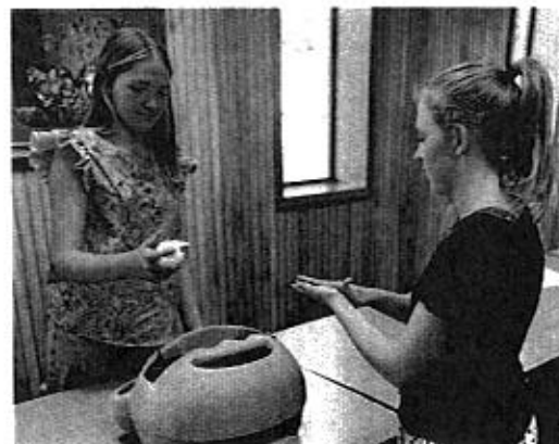
Picture Two - FCCLA officers assisting with a food workshop